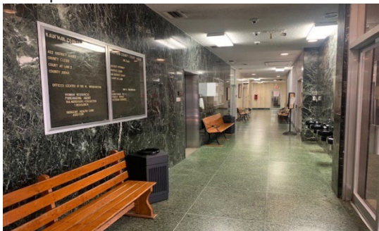
Pictured above is the inside of the vacant Courthouse at 100 W. Mulberry Street in Kaufman.

County officials recently toured the now vacant historic courthouse on Mulberry Street to start discussions about its future use. Although no decisions were made about which departments will move into the building once it is renovated, the site visit opened the door for an evaluation of each department's needs.